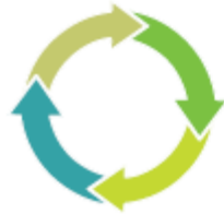
A WHOLE-SYSTEM VIEW

“A modern, integrated, clean energy system, delivering reliable energy supplies at an affordable price in a market that treats all consumers fairly.”