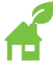
A SMARTER MODEL OF LOCAL ENERGY PROVISION