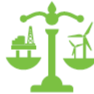
A STABLE, MANAGED ENERGY TRANSITION