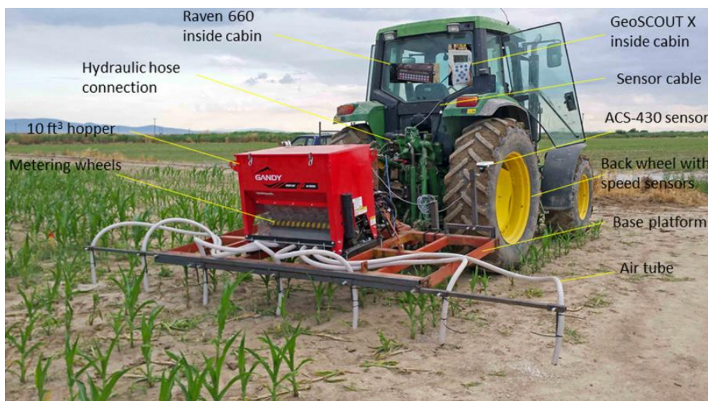
Figure 1: Example of a VRNT system (Stamatiadis et al. 2018)

Machine guidance technologies are systems that pilot machinery using GPS in order to reduce overlaps of and avoid gaps between passes. At the entry level a GPS receiver mounted on the machinery and a lightbar or an on-board display providing driving direction is needed; with such systems \pm 40 cm accuracy can be achieved. More advanced solutions, with accuracy up to \pm 2 cm, use auto-guidance systems (auto-steering) integrated in the tractor's hydraulics and directly control steering. Machine guidance is a prerequisite for VRNT, but could be used in itself (Barnes et al. 2017a).